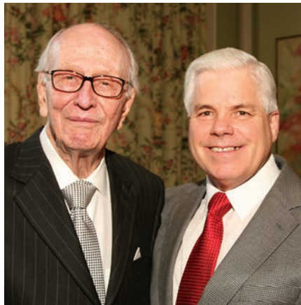
2011 Doctor Luke Society Banquet