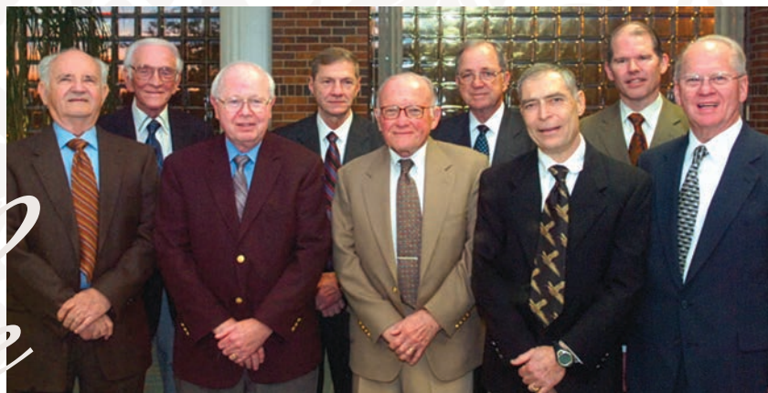
2007 Doctor Luke Society Banquet