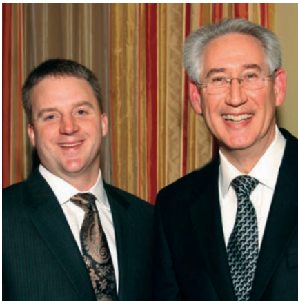
2010 Doctor Luke Society Banquet