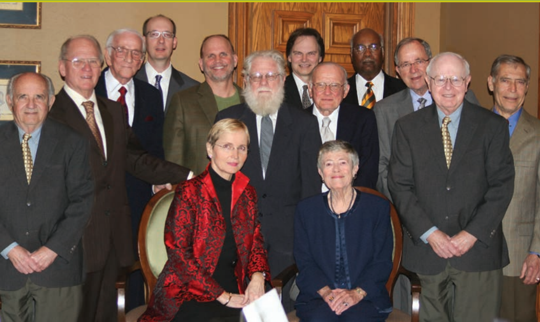
2009 Doctor Luke Society Banquet