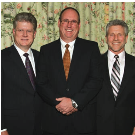
2012 Doctor Luke Society Banquet