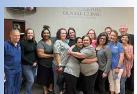
SonShine Lighthouse Dental

Camp V was just one of many nonprofits who have been helped this year through the free dental clinics. Other groups include Highway 80 Rescue Mission, SonShine Lighthouse, Calvary Commission and New Creation Foundation.