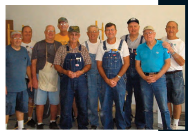
Christian Volunteer Builders